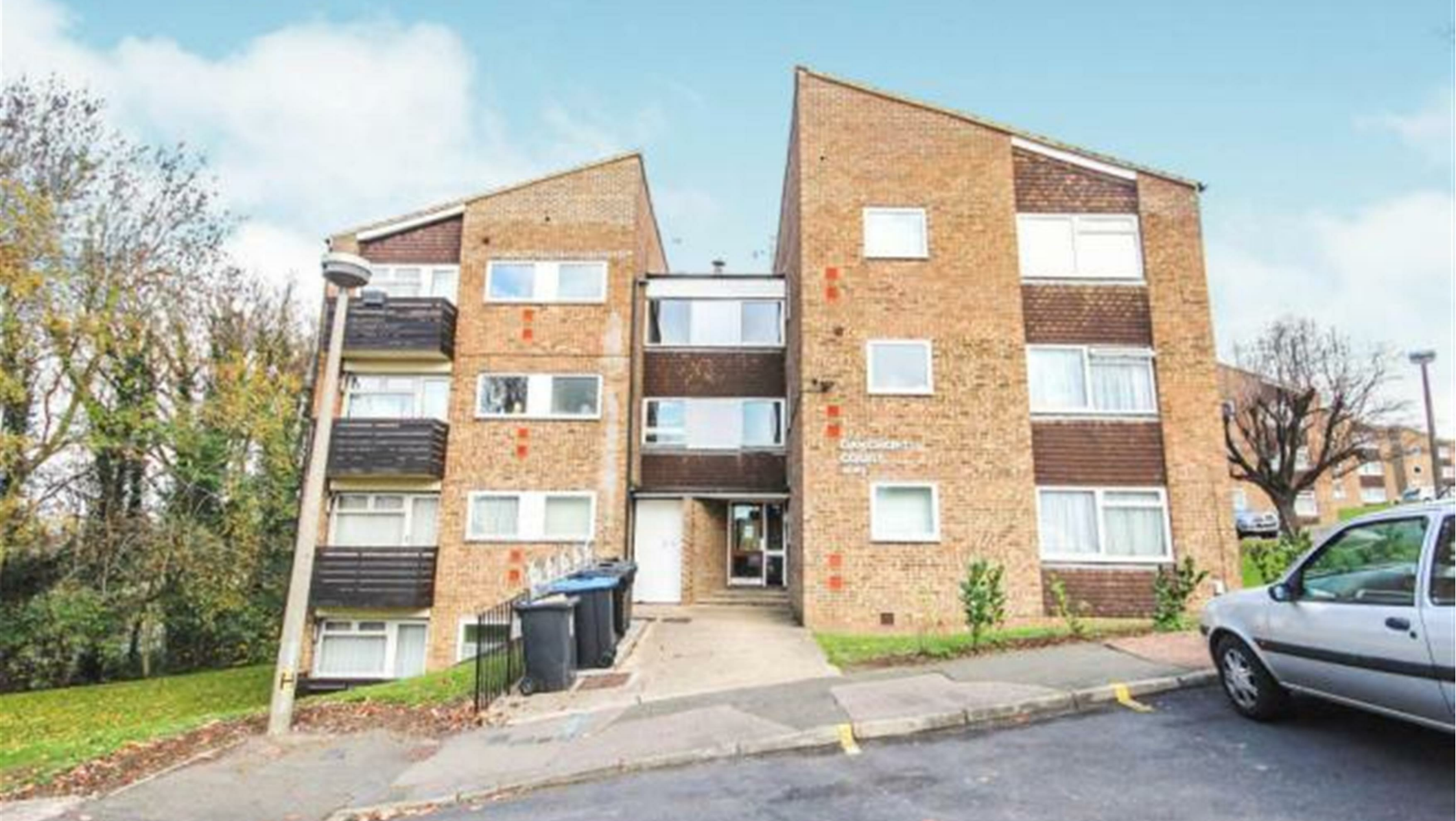
39 Oakcroft Court, Fern Drive, Hemel Hempstead, HP3 9EU Asking Price £230,000